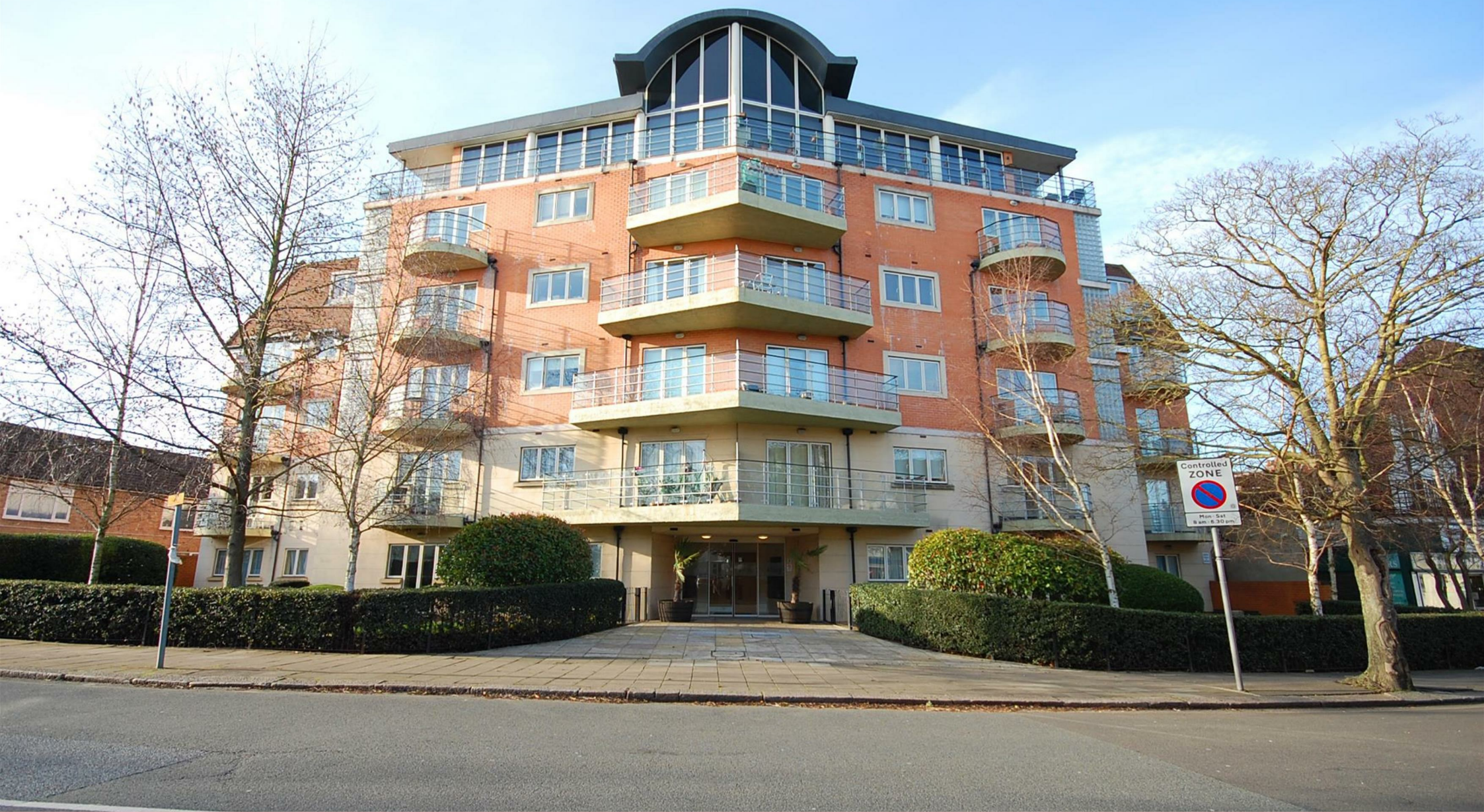
The Thomas More Building, Ruislip, HA4 7BA